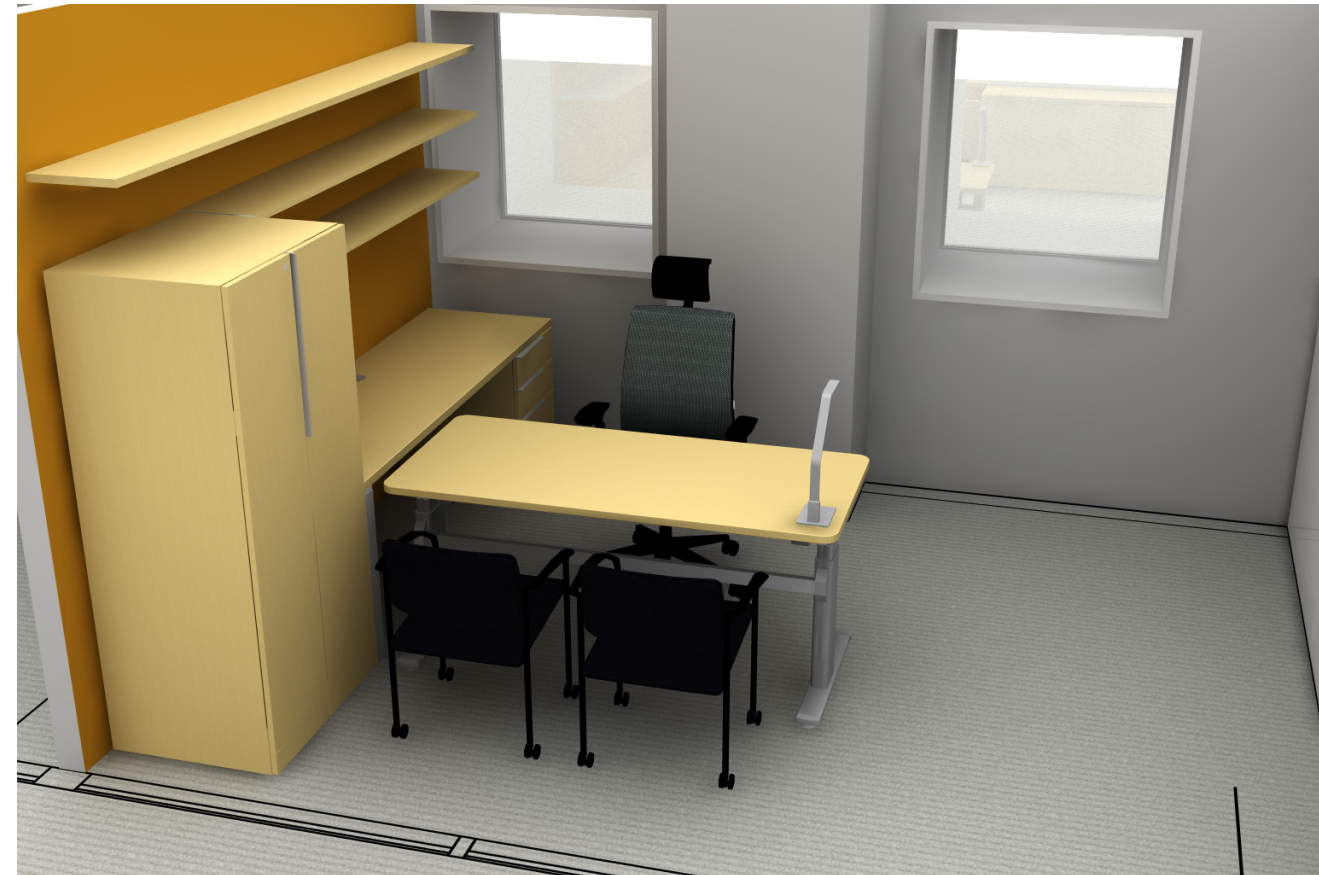
OFFICE 414 (SHASHA)