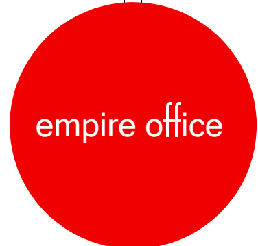
OFFICE 414 (SHASHA)