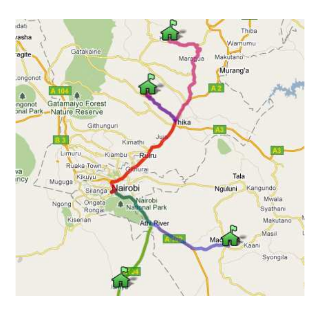
Figure 3: Map of the 5 participating schools of our large-scale pilot.

ally contained mostly dead links. We removed these pages from the index for our larger pilot. In addition, we implemented a Firefox browser extension to highlight links that are found in the cache so users could avoid clicking on links.