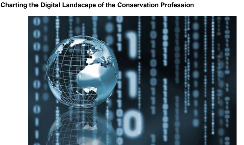
Feedback Needed on our Digital Landscape Draft Report

FAIC has engaged in a year-long research and planning project, "Charting the Digital Landscape of the Conservation Profession." Rather than polish up the final project report, we are asking for your thoughts and comments while it is still in draft form. We have posted the draft of the Digital Landscape report on a special website within Conservation OnLine (CoOL) that can collect paragraph-level comments. We welcome your thoughts, and please feel free to share the link with your networks and other interested parties: