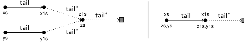
Fig. 5: Lists x_s , y_s and their greatest common suffix z_s

Example 3: interactive theorem proving. Given a complete specification of functions such as drop and gcd in our logic, we can use our decision procedure to automatically prove more complex properties about such functions. For instance, the function drop is not just defined in the Scala standard library, but also in the theory List of the Isabelle/HOL interactive theorem prover [15]. Consider the following property of function drop :