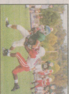
Hanover Hawks, PHS Patriots football previews.