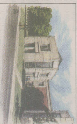
The John B. Werner Pavilion