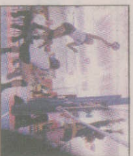
Volleyball teams showcase talents.