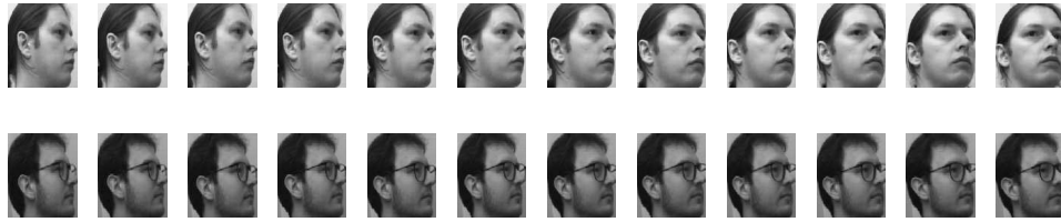
Figure 3: A sampling of the face data (two people). Each row shows a random sampling of images from a cluster discovered by maximum margin clustering. Maximum margin made no misclassifications on this data set, as shown in Table 1.