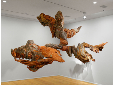
Little People." Read more

The Institute of Fine Arts continues its ongoing Great Hall Exhibition Series by showcasing sculptor Charles Simonds's Mental Earth in the Great Hall, opening April 1, 2016. The exhibit was organized by IFA PhD student Julia Pelta Feldman, and will be accompanied by a dialogue and day-long symposium featuring the artist.