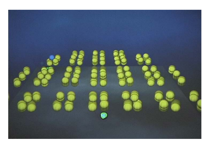
Figure 7: Example Screen shot of Squidball game. Please see video for game in action.

After many discussions and iterations with the prototyping system, we settled on the game rules described below.