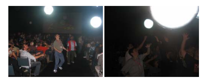
Figure 8: Squidball Gamers

In the control both, we had a control which we could adjust to alter the sensitivity of the game during play. Turning up the sensitivity made the virtual target sizes larger and therefore gameplay easier. Turning down the sensitivity made the virtual target sizes smaller and gameplay harder.