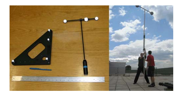
Figure 5: Left: The standard sized calibration objects of length 15 inch. Right: Large 15 feet high wand.