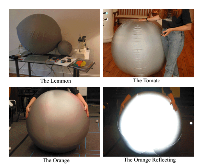
Figure 3: The evolution of our retro-reflective balls.

After dozens of tests with paint, tapes, and fabrics of varying color, reflectivity and weight, we settled on specific 3M retroreflective fabric (model # 8910). Figure 3 shows the results of these tests. The first test (the "lemon"), the second iteration (the "tomato"), and the final version (the "orange"), which ultimately produced a perfectly round spherical shape.