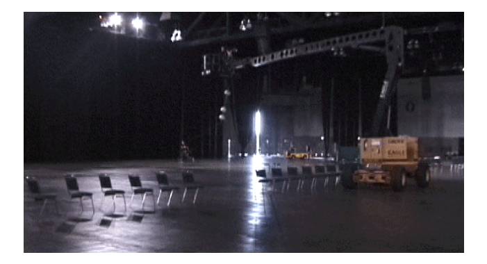
Figure 6: Calibration in Hall K using a crane.